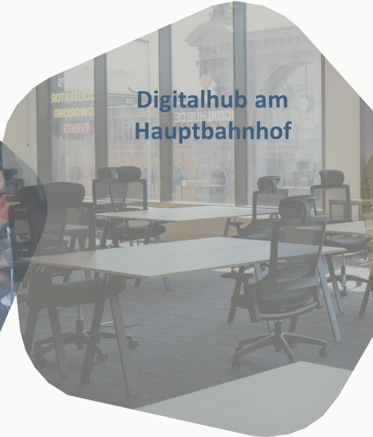
Digitalhub am Hauptbahnhof